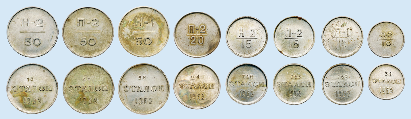
Lot of 8