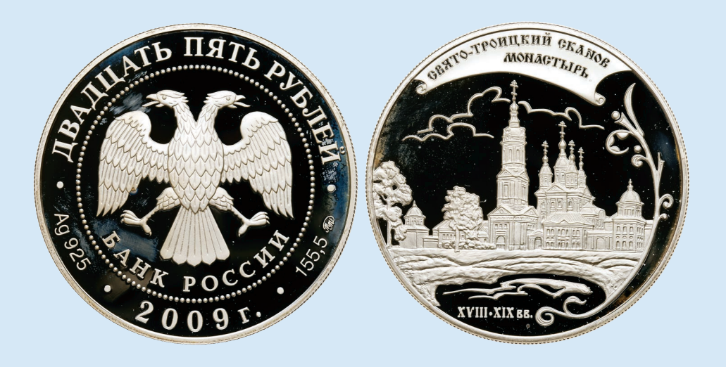
25 Roubles 2009. St. Petersburg mint. St. Trinity Monastery, Pensu region. 155.5 gm. Y1186. Mintage of only 1,500 pcs. Proof.