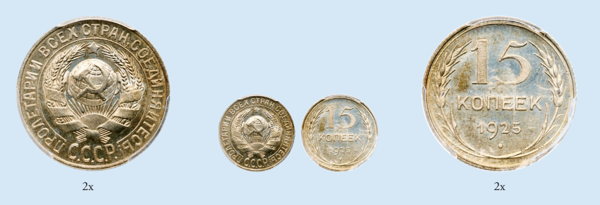
2263 15 Kopecks 1925. Authenticated and graded by PCGS PR 65 (# 38930265). Gem brilliant PROOF.