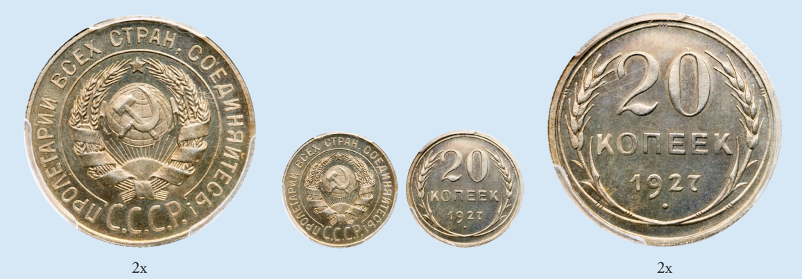
20 Kopecks 1927. Fed 1311. Authenticated and graded by PCGS PR 65 (# 38785362). Lustrous, pale russet hues. Gem brilliant PROOF.